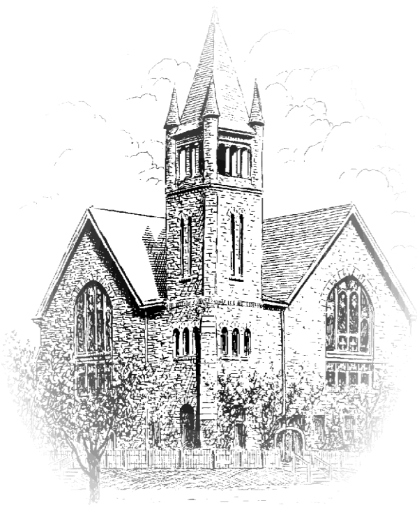
Evangelical Lutheran Church Red Hill, Penna.

Sunday, February 12, 2012 Sixth Sunday after Epiphany