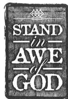
Ecclesiastes 5:7b, NIV