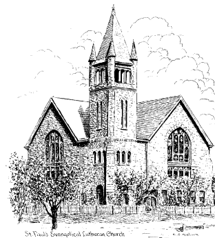
St. Paul's Evangelical Lutheran Church Red Hill, PA